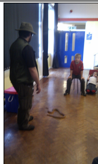
After school club meet some snakes at Zoo lab!