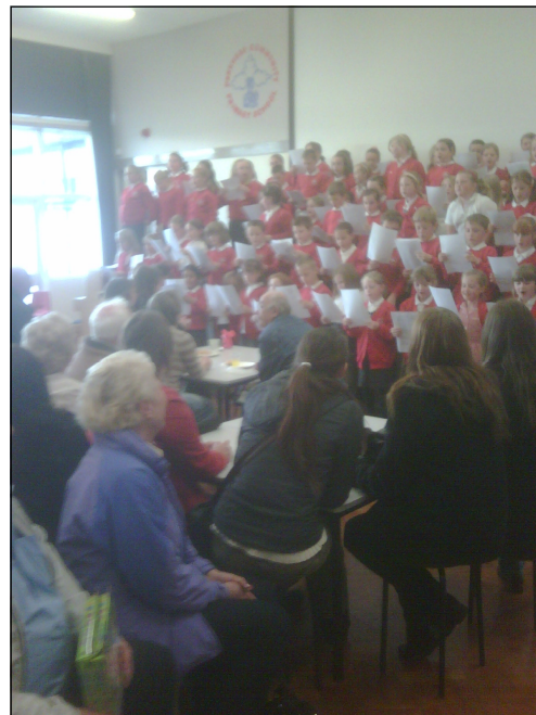
The School Choir

Class photos will be taken by the photographer next Tuesday 25th January. Your child will be coming home with an order form on the day.